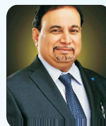
Executive Director COMHAD