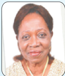
Dr Adenike Grange (Africa)