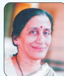
Scientific Committee Chairperson