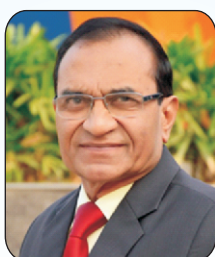
International President COMHAD