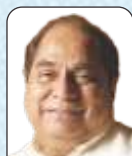
Padmashree Dr. D Y Patil Ex. Governor-Bihar & Tripura