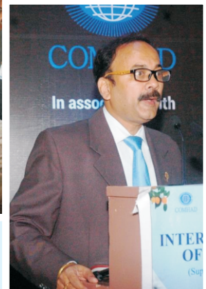
Hon'ble Union Minister Shri. Nitin Gadkari inaugurating International COMHAD Conference 2015